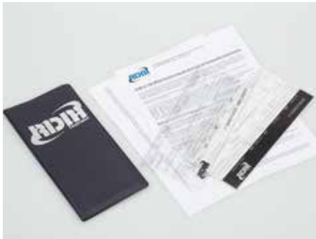
E-13B position gauge Part# 630105 $70.00ea