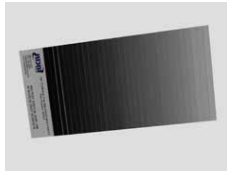
QCX image calibration document Part# 630415 $116.00ea