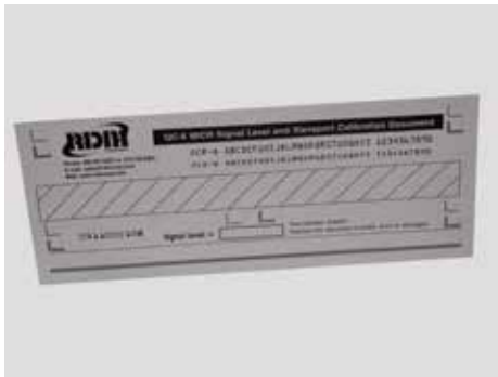
QCX MICR calibration documents (5/pack) Part# 630300 $80.00ea