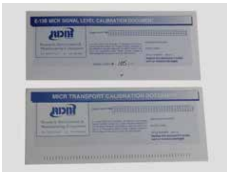
Calibration documents combo package Includes: Five signal calibration documents and five transport calibration documents Part# 630146 $145.00ea