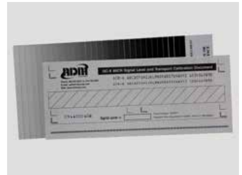
QCX MICR and image calibration combo package Includes: Five MICR calibration documents and one image calibration document Part# 630301 $170.00ea