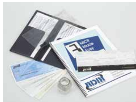
MICR education kit Includes: E-13B gauge, comparator and MICR Made Easy manual Part# 630150 $160.00ea