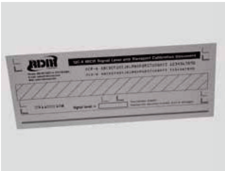
QCX MICR calibration documents (5/pack) Part# 630300 $80.00ea