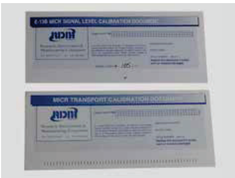
Calibration documents combo package Includes: Five signal calibration documents and five transport calibration documents Part# 630146 $145.00ea