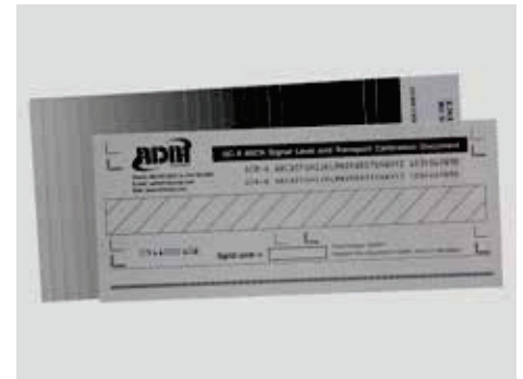
QCX MICR and image calibration combo package Includes: Five MICR calibration documents and one image calibration document Part# 630301 $170.00ea