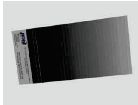
QCX image calibration document Part# 630415 $116.00ea