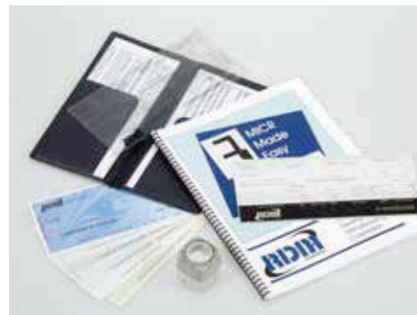
MICR education kit Includes: E-13B gauge, comparator and MICR Made Easy manual Part# 630150 $160.00ea