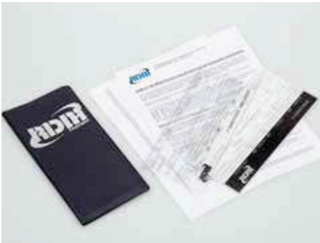
E-13B position gauge Part# 630105 $70.00ea