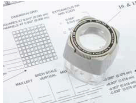
E-13B comparator Part# 630103 $80.00ea