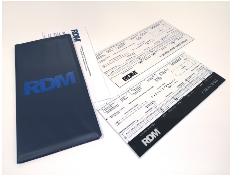
E-13B position gauge Part# 630105 $70.00ea