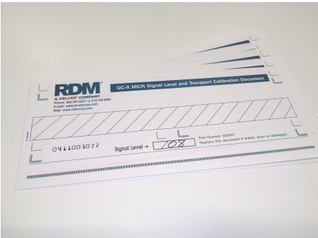
QCX MICR calibration documents (5/pack) Part# 630300 $80.00ea