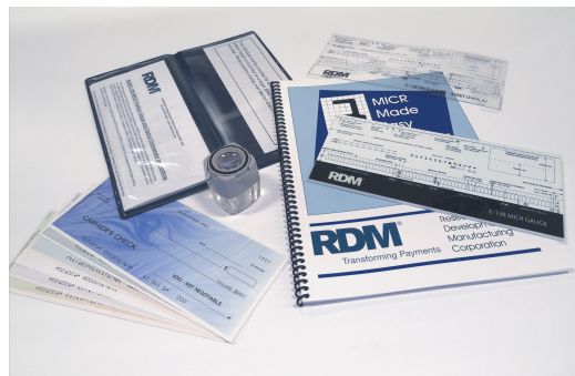
MICR education kit Includes: E-13B gauge Comparator MICR Made Easy manual Part# 630150 $160.00ea