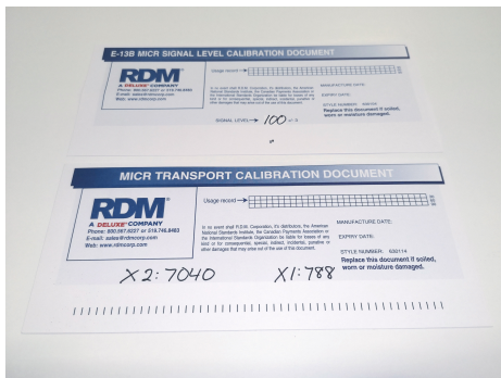
Calibration documents combo package Includes: Five signal calibration documents Five transport calibration documents Part# 630146 $145.00ea