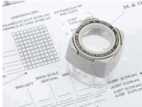
E-13B comparator Part# 630103 $80.00ea