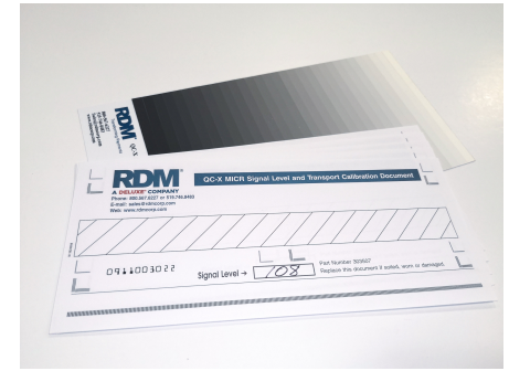
QCX MICR and image calibration combo package Includes: Five MICR calibration documents One image calibration document Part# 630301 $170.00ea